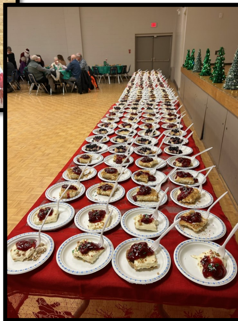
Cheesecake as far as the eye can see!