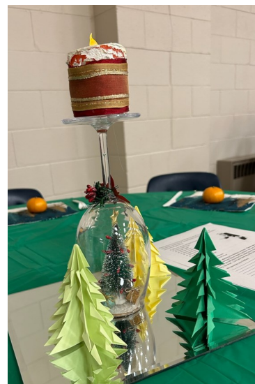
Table Centrepieces made by Starbuck craft group

If anyone has any photos they took at the event and would like to share with me, please email them to info@macdonaldseniors.ca